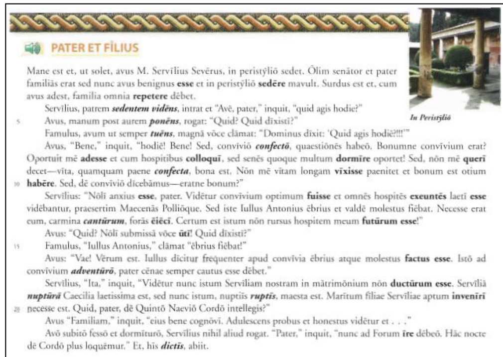
Figure 5. Disce! , Chapter 29

Disce! teaches indirect statement later in the game, Chapter 29 in Volume Two (out of forty chapters across two volumes). I do like the clever move in the reading: the grandfather, hard of hearing, misunderstands his interlocutors and so needs everything repeated to him—which happens in indirect statement (see Figure 5). The passage highlights the construction with italic and bold type for the introductory verb, accusative subject