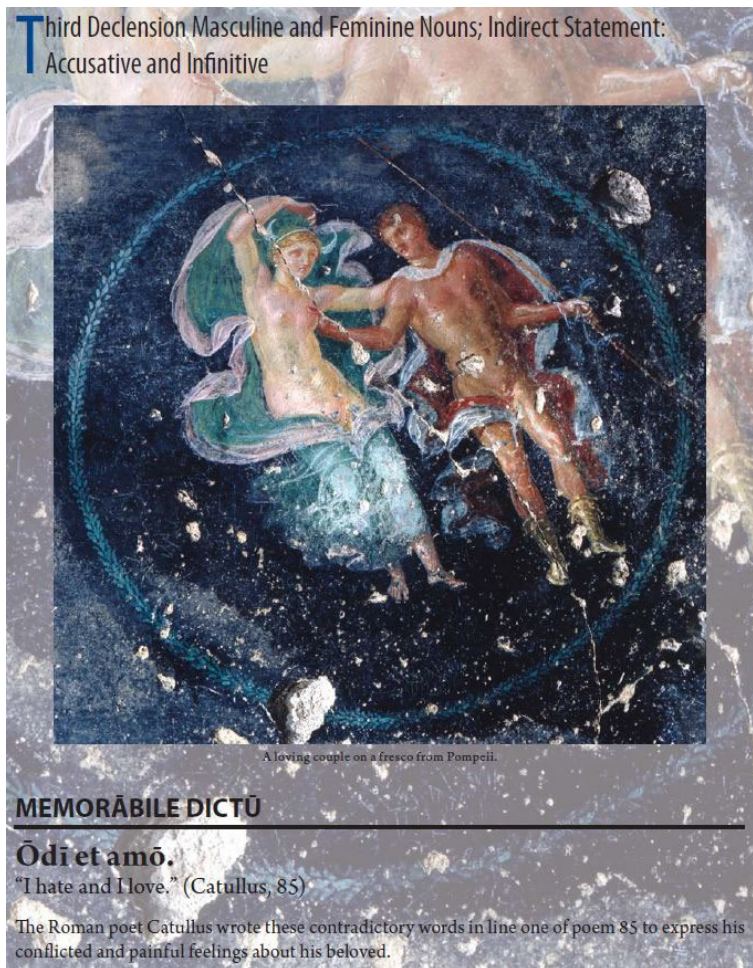
Figure 1. Latin for the New Millenium, Chapter 7, p. 1.111

Second, the series encourages conversation in Latin, starting with the modern dialogues that conclude each chapter. More significantly, the Teacher’s Manual facilitates the practice of oral comprehension and production with multiple exercises constructed for each chapter. A script is provided, so teachers need not speak extemporaneously in Latin. These exchanges range from transformation (e.g. TM1.182 Change the plural form into the singular. Teacher: aedificābāmus . Expected response: aedificābam ) to comprehension (e.g. TM1.257. Teacher: Quis ad vīllam venit? Expected response: Seneca ad vīllam venit ). Also available for purchase are MP3 files of the adapted passages read by Anna Andresian and Professor E. Del Chrol.